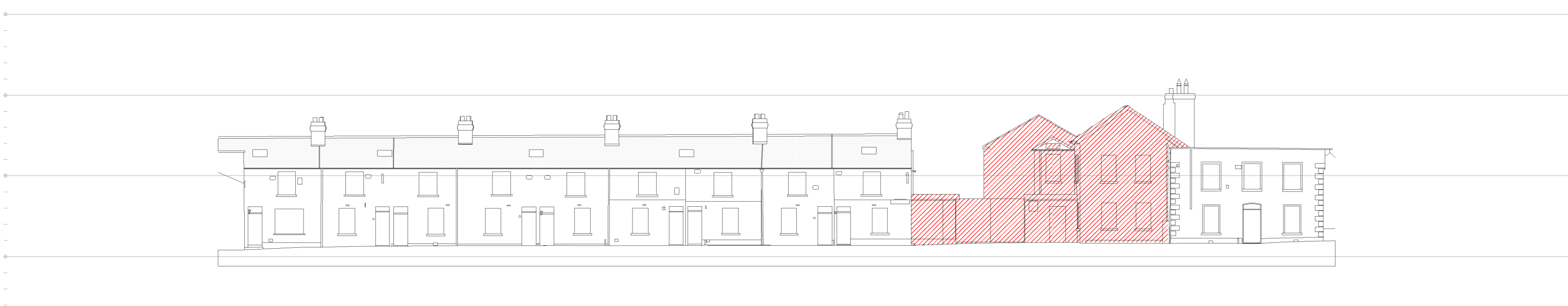
4 Section 18 - Rehoboth Avenue 1:200